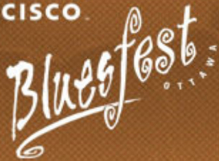
Signing the OBS shirt